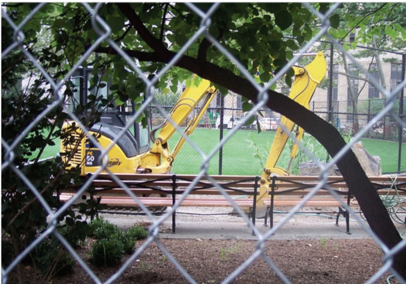
COLUMBUS PARK, MANHATTAN This synthetic turf field opened during the summer of 2005 after much community debate.

Community groups on both sides of this debate have brought the issue to the media and raised it in park policy discussions. As the only citywide advocacy group for New York City's parks, New Yorkers for Parks (NY4P) offers an independent, in-depth analysis of synthetic turf in this report. This paper will examine the financial and environmental costs of natural vs. synthetic turf and the implications for usage, maintenance, health and safety, assess the current community input processes, and offer policy recommendations toward the best use of this new technology.