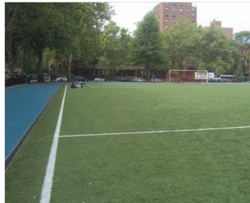
THOMAS JEFFERSON PARK, MANHATTAN "New generation" of FieldTurf installed in 2003