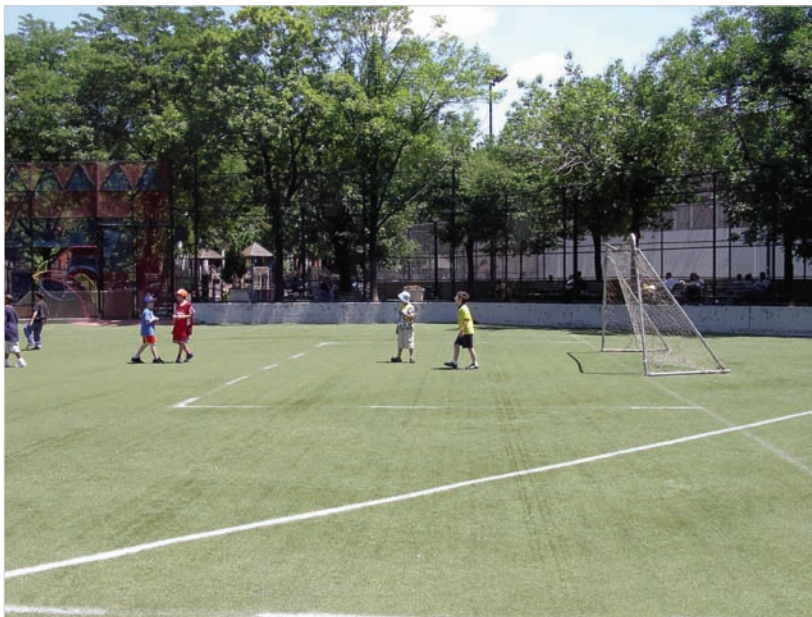
JAMES J. WALKER PARK, MANHATTAN Safety must be the first priority at athletic facilities, including synthetic fields like this one.

Many athletes are unfamiliar with the “new generation” of synthetic turf. Improve safety by notifying users what dangers to look out for before using synthetic fields, such as loose seams that could create a trip hazard. Users with questions or issues should be directed to 311.