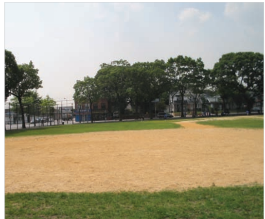
PAERDEGAT PARK, BROOKLYN Natural grass field