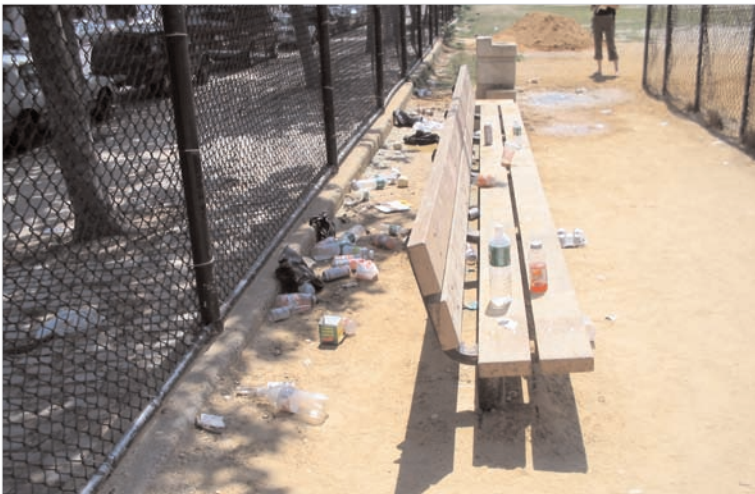
LEIF ERICSON PARK, BROOKLYN Keeping up with maintenance of ballfields has been a challenge for the Parks Department's limited staff.

DPR has stated that the number of requested permits for baseball and softball fields has doubled over the past six years 5 , showing tremendous growth in the popularity of recreational sports. The debate over closing athletic fields pits public access against sufficient maintenance, presenting a tough decision for park managers. Grass fields that are open to the public year-round for sports—particularly soccer—are virtually guaranteed to wear out.