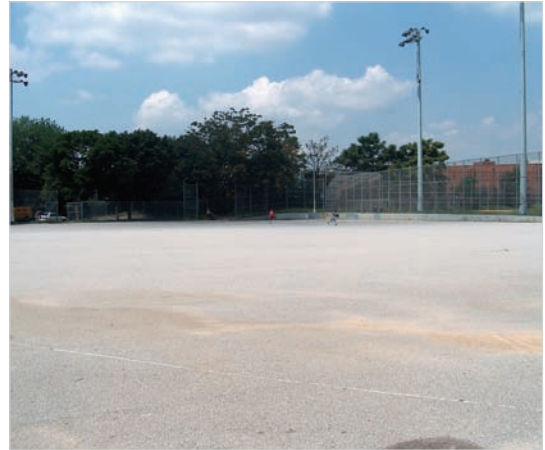
MAFERA PARK, QUEENS Asphalt ballfield

Since beginning its synthetic turf program, the Parks Department has been contracting primarily with the manufacturers FieldTurf and AstroPlay for synthetic turf installations. These surfaces were designed to replicate the look and feel of natural grass and represent a giant leap forward from traditional AstroTurf, which was a hard, carpet-like surface developed in the 1960s. 9 AstroTurf produced new injuries to athletes such as "turf toe", caused by a player's cleat getting caught in the turf, which had virtually no give. 10 FieldTurf is widely praised as a great improvement over traditional AstroTurf and, judging from its popularity, has largely been able to