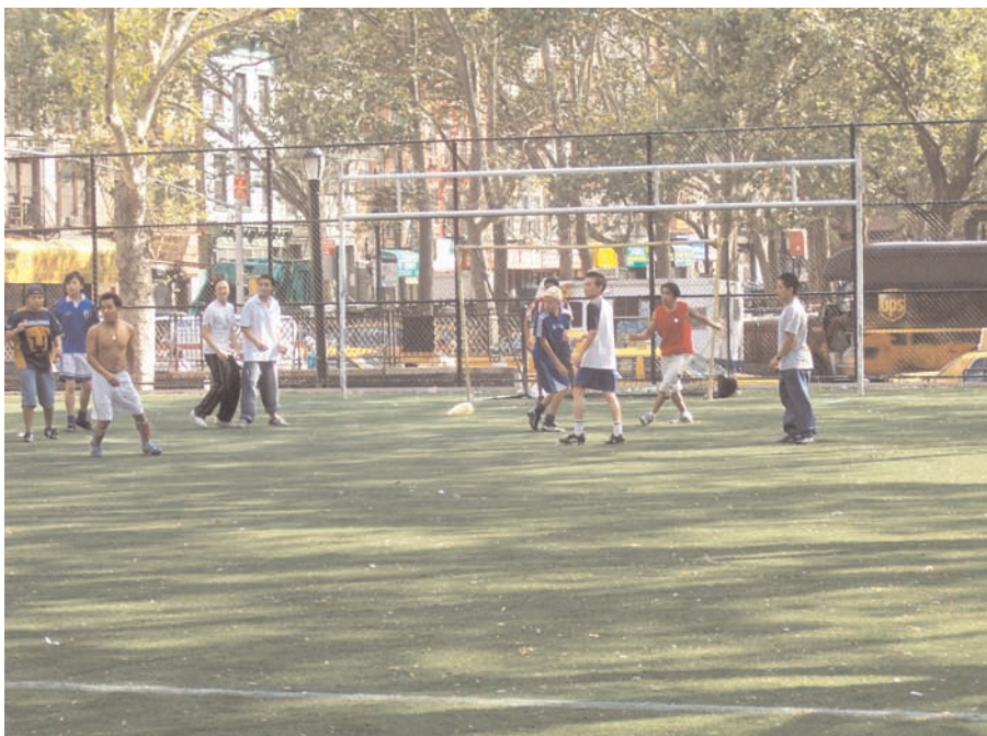
SARA D. ROOSEVELT PARK, MANHATTAN The amount of maintenance that a synthetic turf field requires depends heavily on its usage.

It should be noted that this cost analysis assumes the Parks Department's current level of maintenance attention to fields, comparing what the Department is presently funded to spend on each type of field. As noted earlier, the conditions of the city's baseball and soccer fields, under this level of funding, are mediocre. In other sections of this report, Parks Department maintenance standards and practices are compared to other park management entities, such as the Central Park Conservancy and the Battery Parks City Park Conservancy. Were these costs of maintaining fields available for this analysis, the difference in the cost of maintaining a turf field versus a synthetic field would be significantly more substantial.