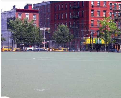
CHELSEA PARK, MANHATTAN "Old generation" of synthetic turf installed in 1998

From Seattle to Howard County, Maryland, municipal governments are turning to synthetic turf for its low maintenance and continual play. The NYC Department of Parks and Recreation is now the number one municipal purchaser of synthetic turf in the country, with the number of fields growing exponentially each year. 12 Over the next two years, Parks Commissioner Benepe's "commitment to ballfields" will devote $50 million to renovate and construct athletic fields. 13 Many of these projects will include synthetic turf.