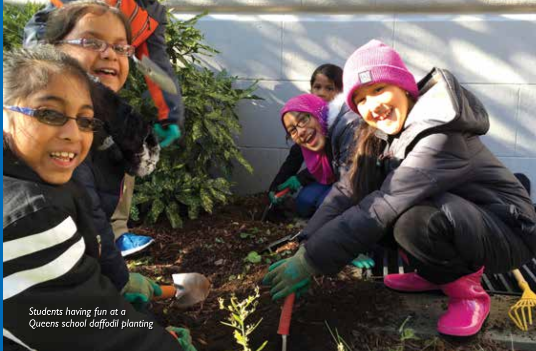
Students having fun at a Queens school daffodil planting